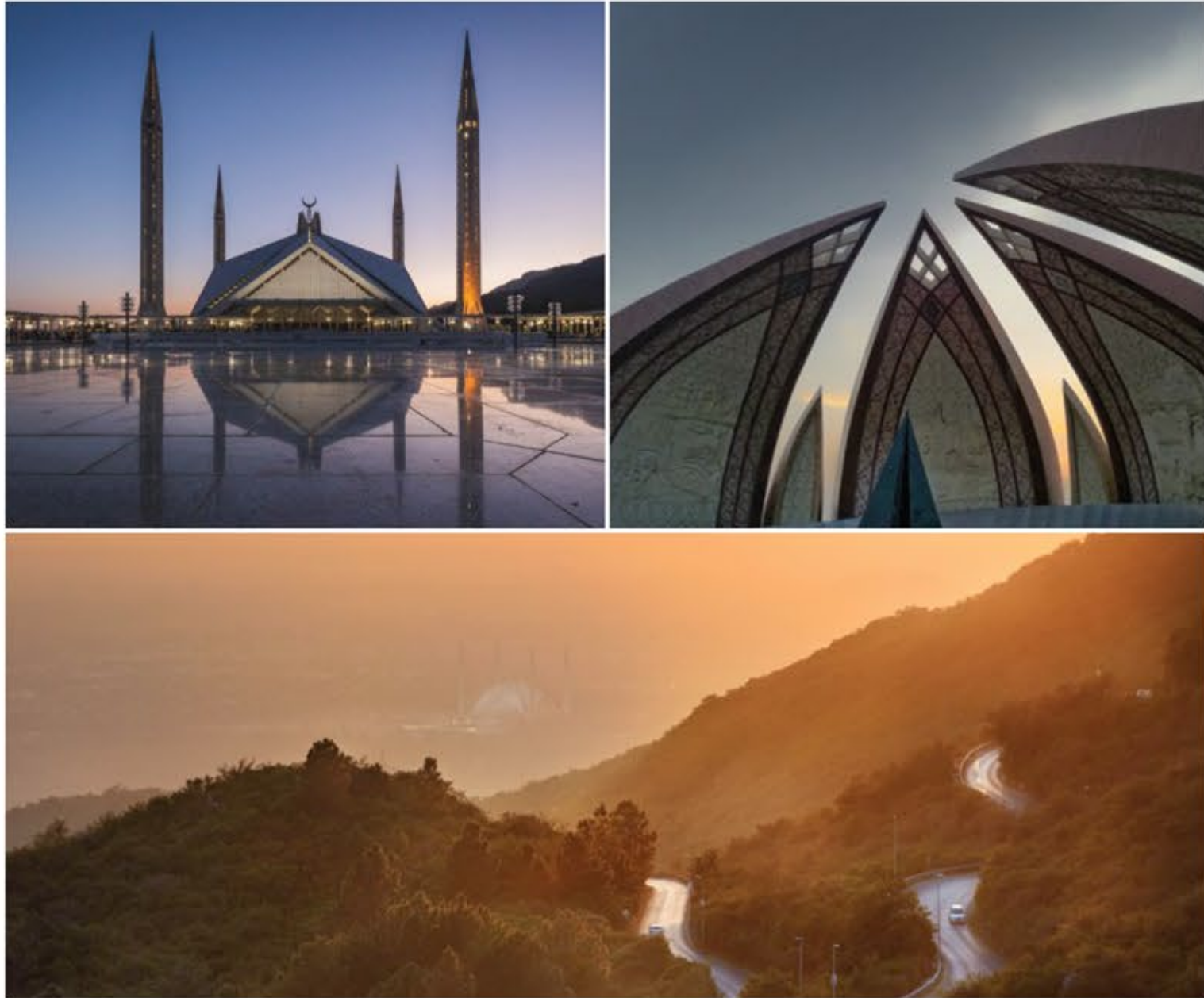
A city of contrast, between the formal grid structure of the city planning and the rolling hills that surround it. A young city purpose-built in the 1960s but full of culture and history in the many museums and monuments.

DESIGN DEVELOPMENT Please note that all aspects of the design for OCA — Grand Hyatt Development are continuously reviewed and reserve the right to make alterations in design without notice.