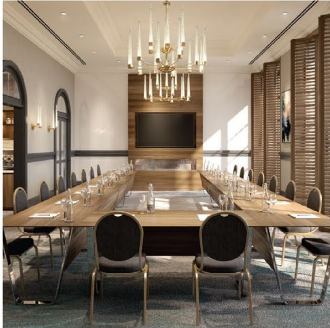
State-of-the-art conference rooms to meet your business needs.