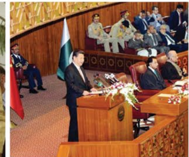
President Xi Jinping addresses a joint session at the Parliament, Constitution Avenue. Islamabad, April 21, 2015.