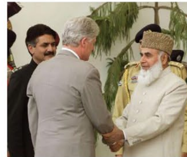
President Clinton is received by President Tarar at the Aiwan-e-Sadr, Constitution Avenue. Islamabad, March 25, 2000.