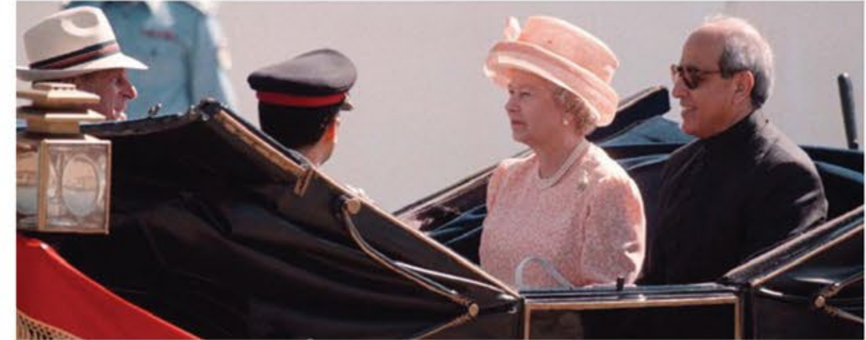
Queen Elizabeth II and Prince Philip, accompanied by President Leghari, on the Constitution Avenue. Islamabad, October 7, 1997.