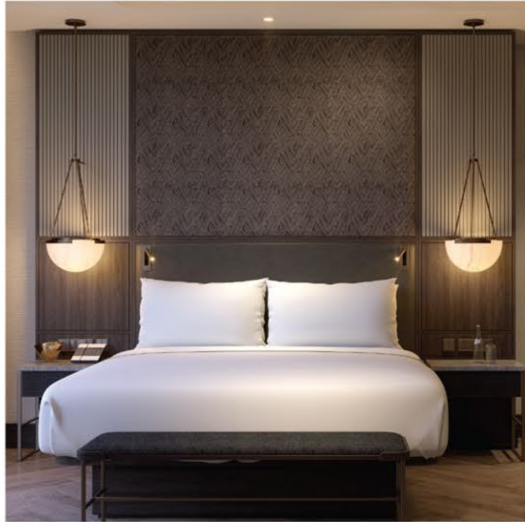
Elegant design with bespoke services for luxury living.